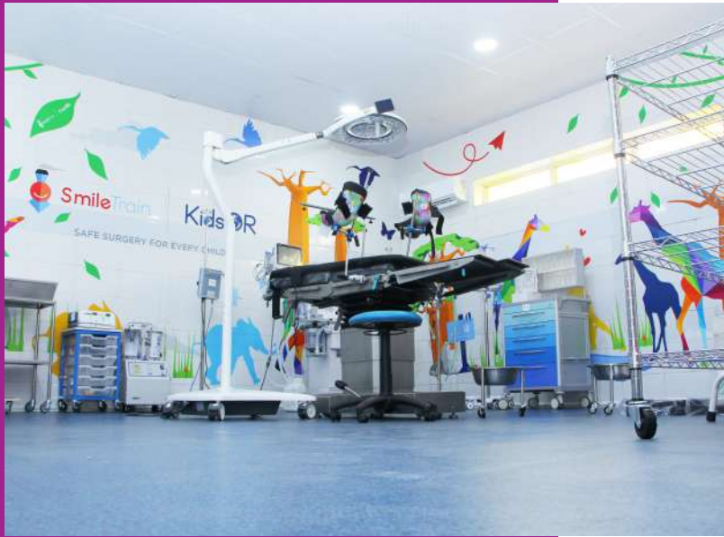
The newly equipped Pediatric Surgery Theatre Suite by KidsOR and Smile Train at the Aisha Buhari Trauma Center.