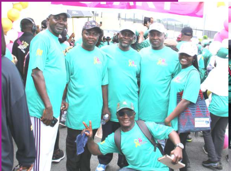
UATH Public Relation Unit at the Okapi Children Cancer Foundation Annual Walk.