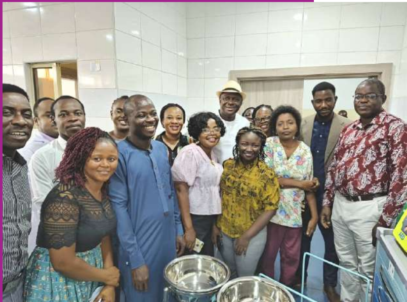
Training at the Paediatrics Surgery Theatre Suite Equipped by KidsOR and Smile Train at the Aisha Buhari Trauma Centre.