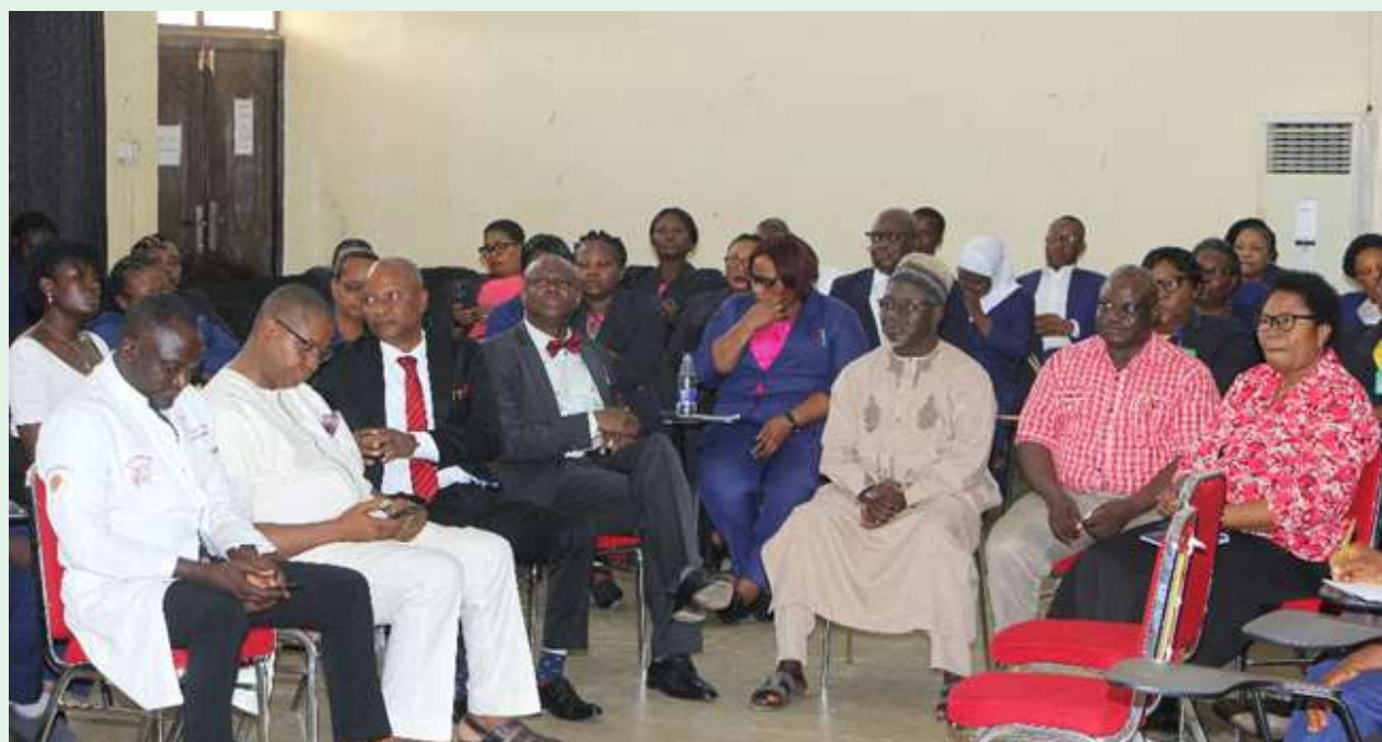
Top Management Committee members and Nursing Department Managers at the Training.