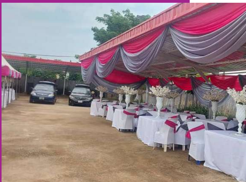
Consultants Car Park @ MDCAN Secretariat UATH