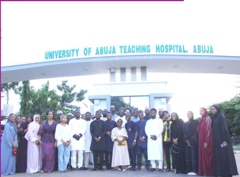
Umar Nijjda Foundation Representatives During their Visit to the Hospital.