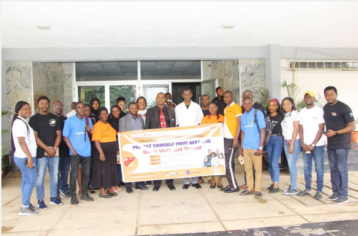
UATH Gastroenterology Unit Celebrating World Hepatitis Day