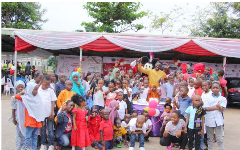
Children Celebrating the World Sickle Cell Day with the Department of Paediatric

The participants also visited the Paediatric Medical Ward, Laboratory, and Emergency Paediatric Units to appreciate the doctors, nurses, and patients in the wards.