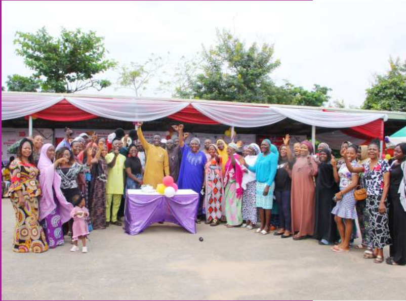
UATH Department of Paediatrics Celebrating World Sickle Cell Day.