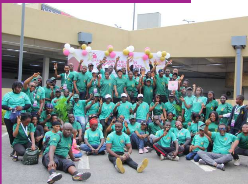
Participants at the Okapi Children Cancer Foundation Annual Walk.