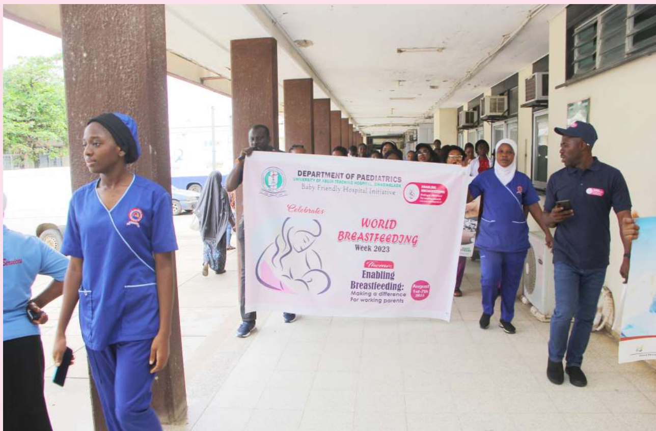
Staff of the Dept of Paediatrics during the World Breastfeeding Week