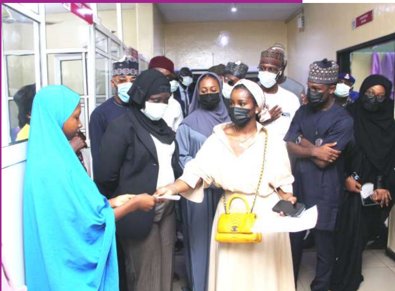
Umar Nijjda Foundation Donating Cash Gifts to Indigent Patients.