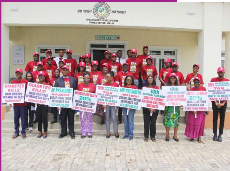
Participants during the Tax on Sugar-Sweetened Beverages Seminar with the placards.