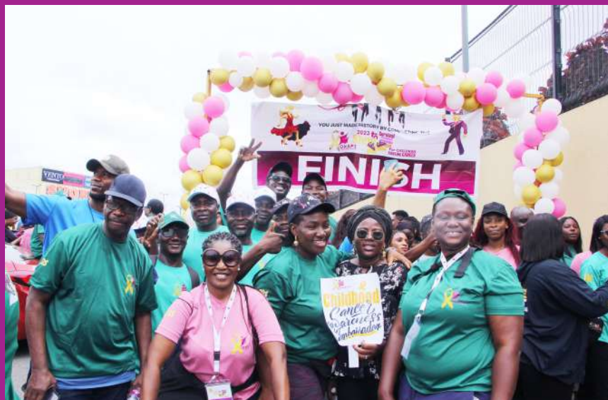
Cross section of UATH staff during the Okapi Children Cancer Foundation annual walk.

The Information Unit, UATH, reports that Okapi Children Cancer Foundation, a Non-Governmental Organisation (NGO) led the walk in Abuja, while other activities included free medical screening and drugs for HIV, Hepatitis, sugar level, blood pressure and others.