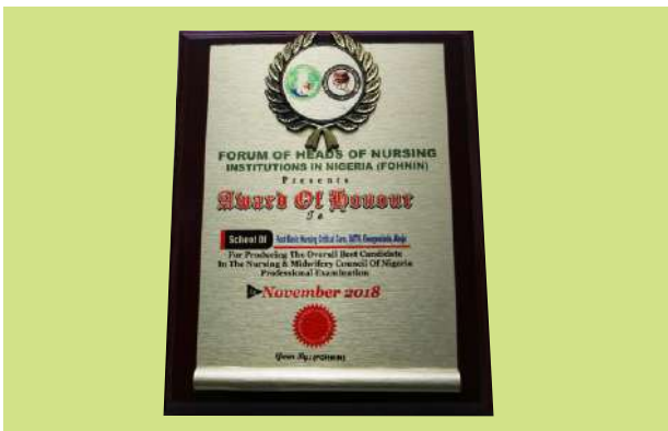
The Award to our ICN School for producing the Overall Best Candidate at the Nursing Council Examination for the year 2018