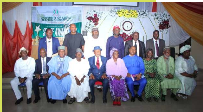
Former CMDs and Members of the UATH 5th Board of Management in a Group Photograph at the 2022 Staff Award Ceremony.