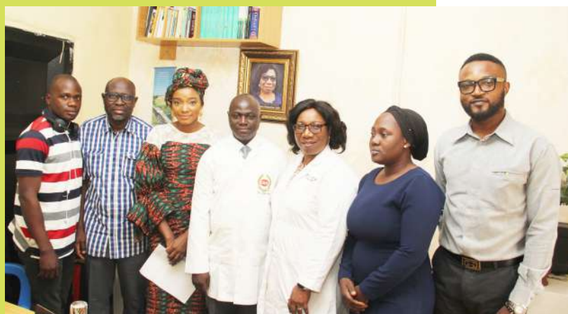
Team for the Scale-up Newborn Screening for Sickle Cell Disease in PHCs in the FCT