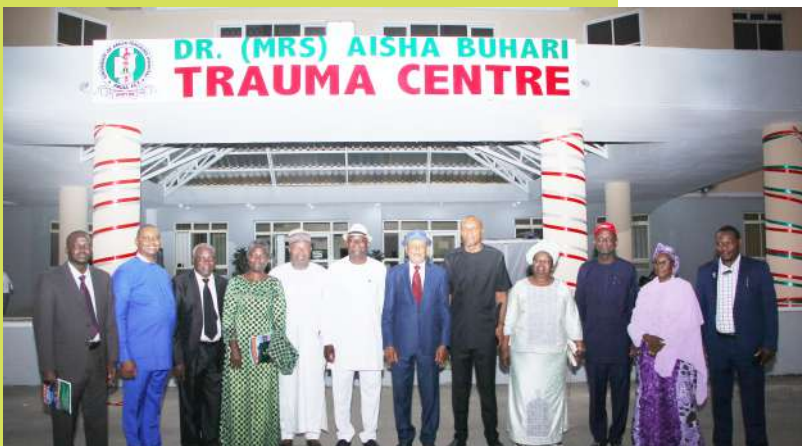
Board Commissioning of the Re-acquired, Renovated, Renamed, Aisha Muhammadu Buhari Trauma Centre