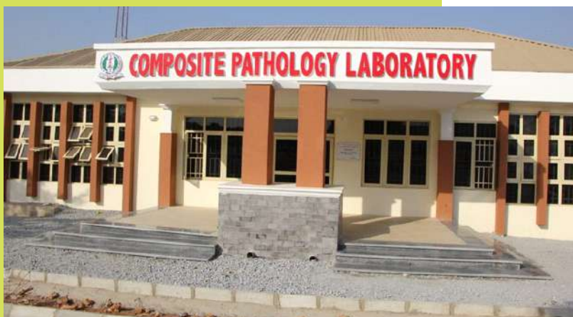
The New Composite Pathology Laboratory