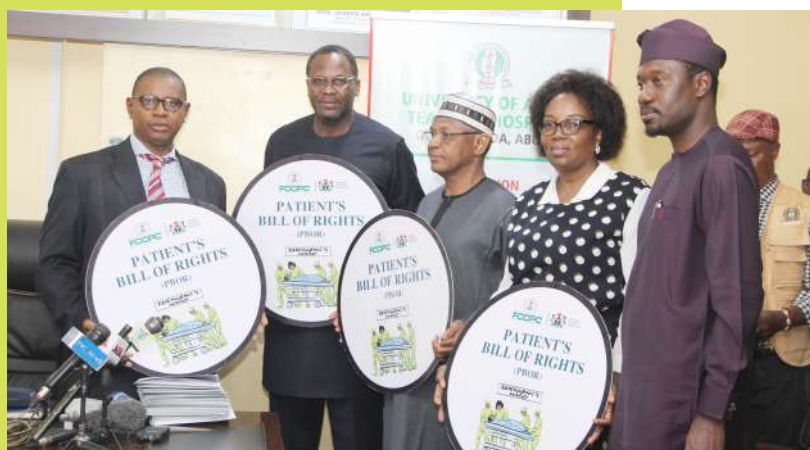
UATH and FCCPC Representatives During the Commissioning of PBOR