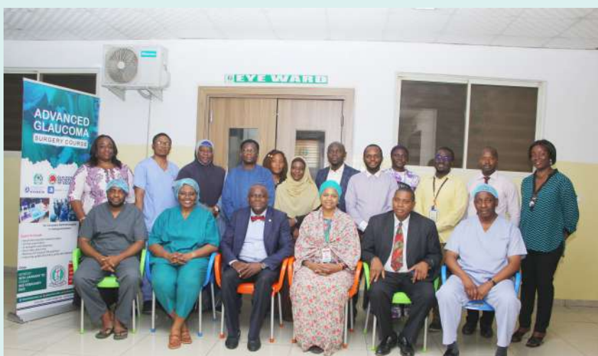
CMD and CMAC in Group Photograph with Course Participants and Facilitators