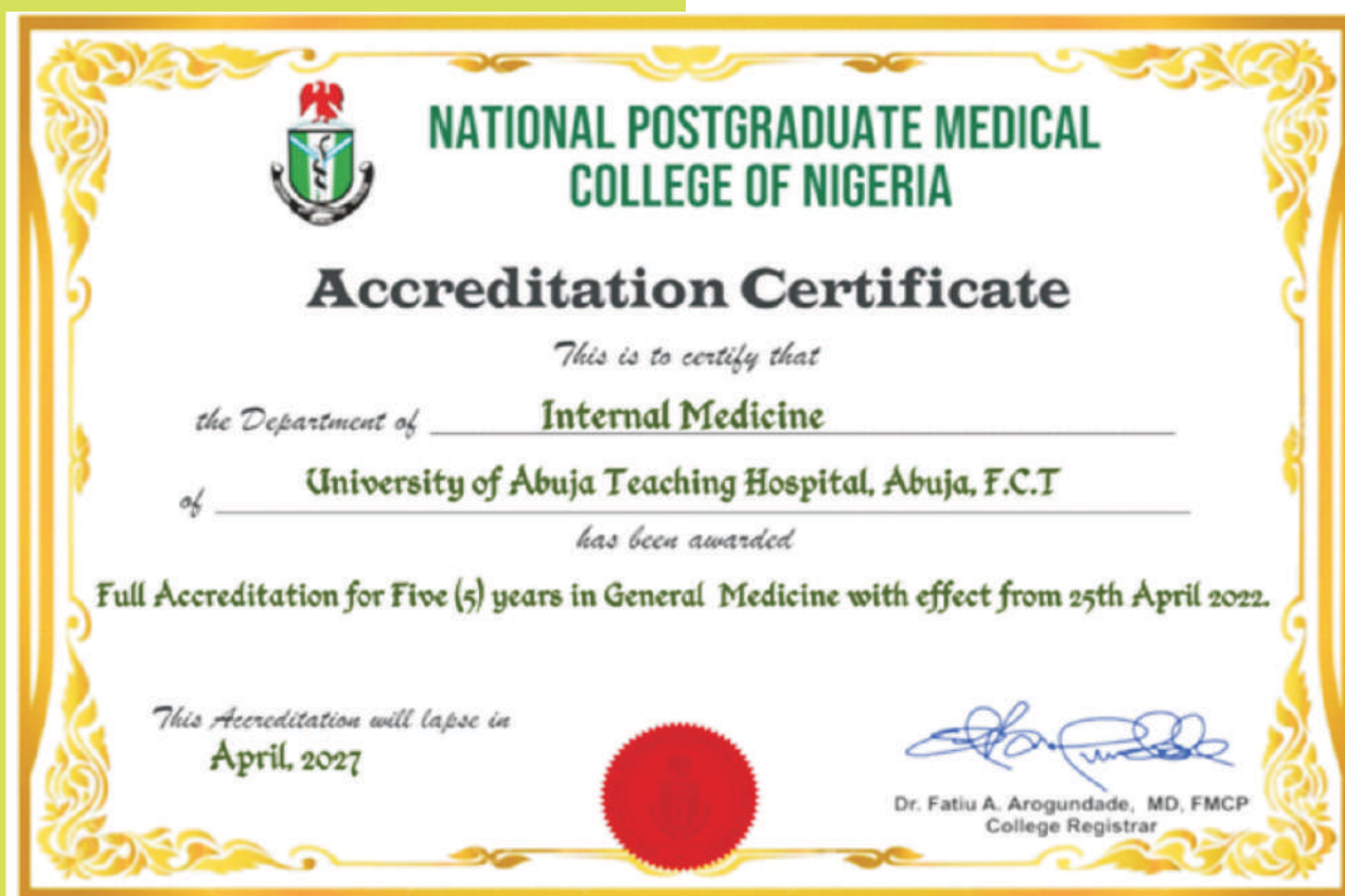
Certificate of Full Accreditation for General Medicine (NPMCN)