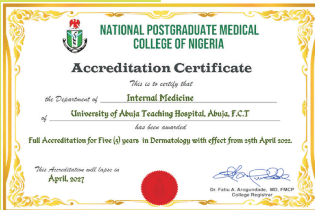
Certificate of Full Accreditation for Dermatology (NPMCN)