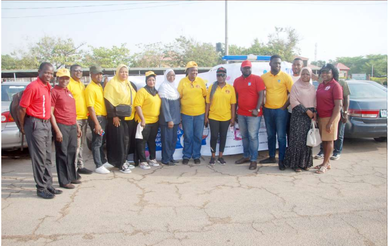
Staff of Nephrology Unit on World Kidney Day

W orld Kidney Day is celebrated each year on the 9th of March. The theme for this year is “ Kidney Health for all ”. Nephrology Unit, University of Abuja Teaching Hospital organized a one-day road show campaign on free kidney screening which took off from University of Abuja Teaching Hospital gate at 9:00 am and proceeded to RTEAN Motor Park, and SDP junction Gwagwalada.