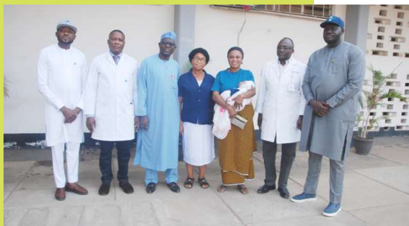
Representatives of the Tinubu Health Initiative with the Benefactor and Staff of UATH