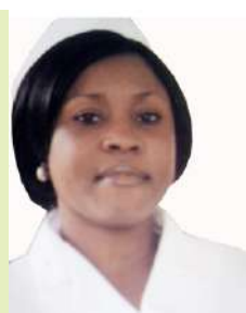
OWOJORI ESTHER POST NATAL WARD