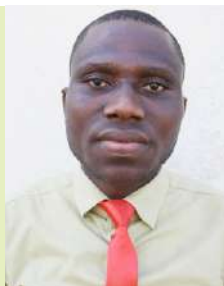
SUNDAY THOMAS HEALTH INFORMATION