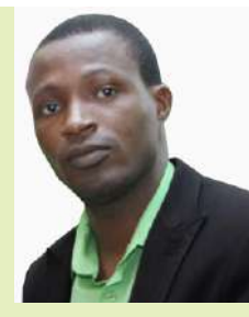
JOHN FRANCIS DENTAL & MAXILLOFACIAL