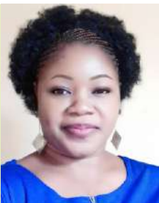
LARE JEMMY OMOWUMI GYNAE WARD