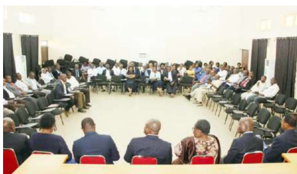
UATH Management having a round table meeting with Consultants at the beginning of the year.