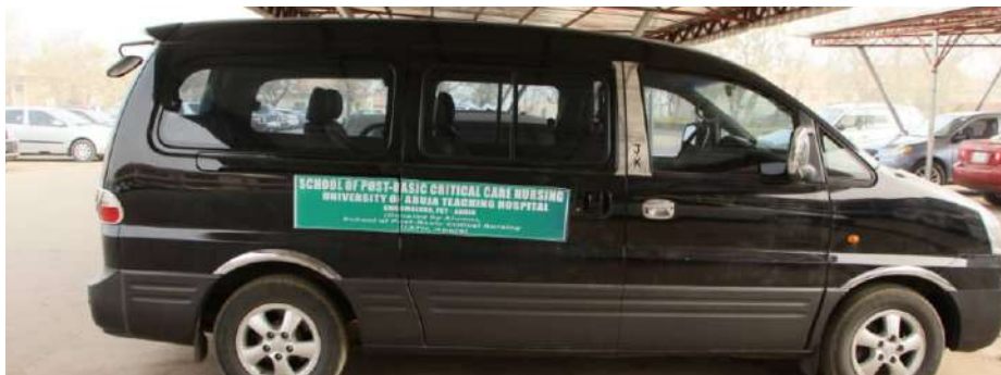
The 10-Seater bus donated by the Alumni of the Post Basic Critical Care Nursing School to the School.