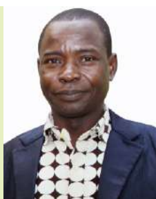
BINGVEN BONGNIM ORTHOPAEDIC WARD