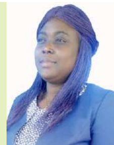
OPEYEMI EZEKIEL LABOUR WARD