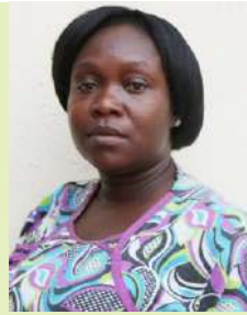
IKUSAGBA GRACE EMERGENCY PAEDIATRIC UNIT