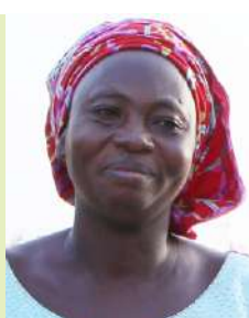
ESTHER YUSUF MEDICAL LIBRARY