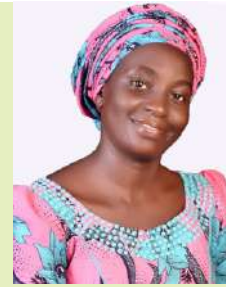
ADAMA YAKUBU INTENSIVE CARE UNIT