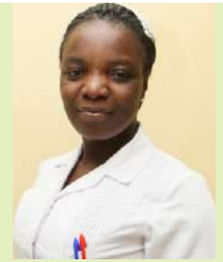
KAUNA MADAKI EYE WARD/CLINIC