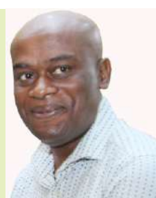
INUWA OKPE PHARMACY