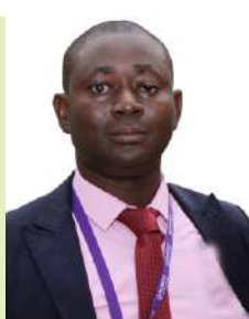
AMOS AMANA FINANCE