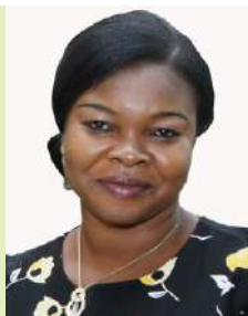
SALOME EZECH ADMINISTRATION