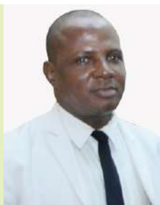
PADA TUKURA OUTPATIENT CLINICS