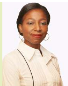
RIMDANI NANLE MENTAL HEALTH