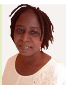
PHILOMINA OMOIEKE LABORATORY