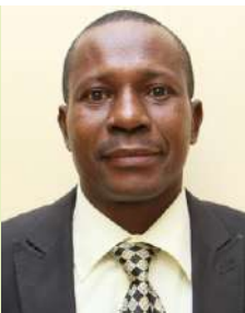
PONTIP GAMBO AUDIT