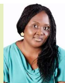
PHIBI AMOS SPECIAL CARE BABY UNIT