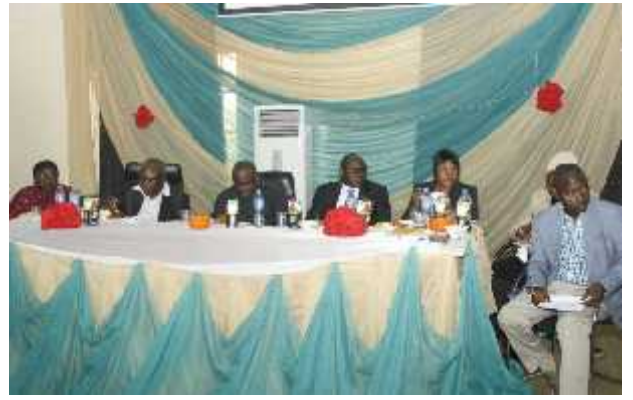
The High Table at the end of the year 2018 party of the Department of Obstetrics and Gynaecology