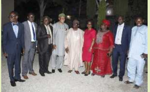
Some Board members in a photograph with the Hon. Minister of Health, Professor Isaac Adewole shortly after inaugurating the House Officers' quarters.