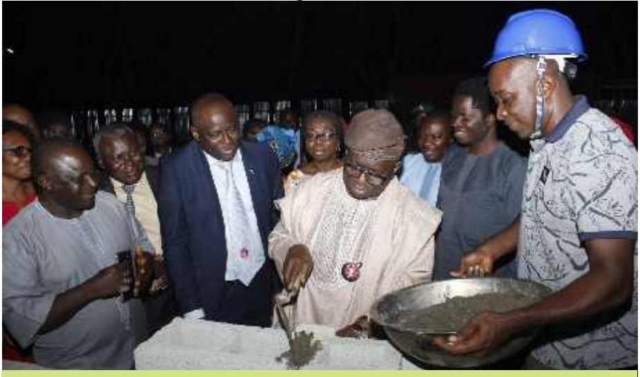
Minister of Health, Prof. Isaac Adewole laying the foundation for the UATH Accident & Emergency Extension.

He thanked the Minister for his pledge to assist the hospital in the execution of the project.