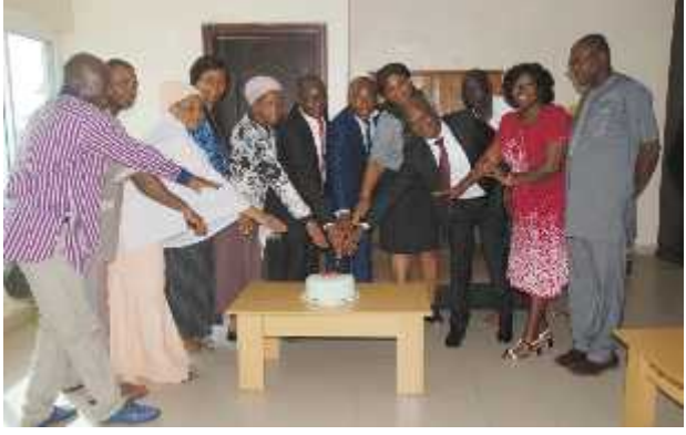
Members of the Committee on Infectious Disease Control and some members of the Hospital's Top Management Committee cutting a Cake to mark the end of a successful outing by the Committee in 2018.