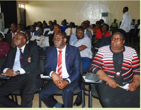
A section of some members of Top Management Committee and staff at the lecture.