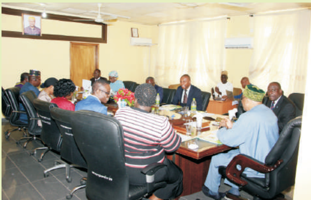
The Board in session.