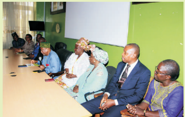
The Board at a meeting with Heads of Department.