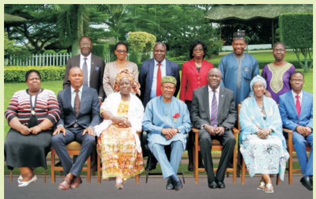
Members of the Board in a group Photograph.