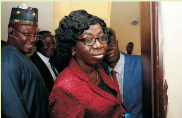
Members of the Board at the equipment room to see the e-health connectivity.