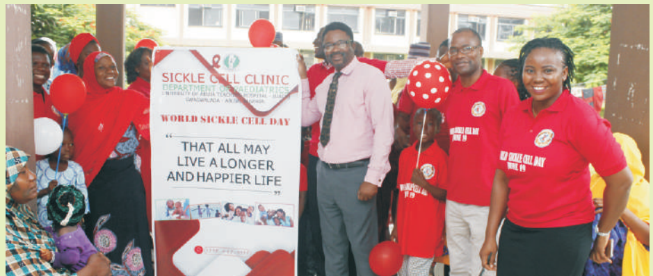
Some of the participants at the 2018 World Sickle Cell Day Celebration