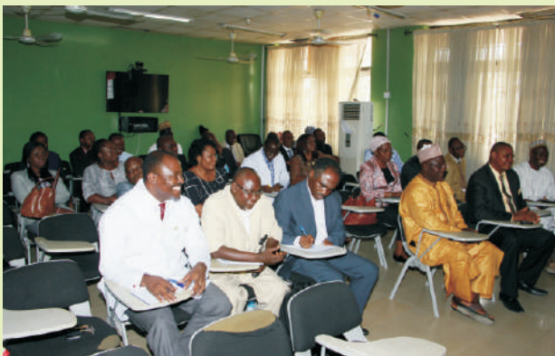
Heads of Department at a meeting with the Chairman and Members of the Board.