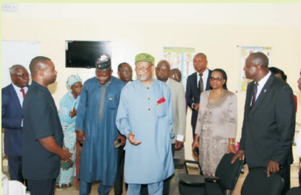
Members of the Board at the Basic Intensive Critical Care Nursing School.