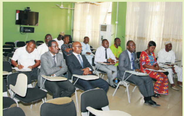
Leaderships of the House Unions and Associations (ARD, JOHESU and MDCAN) at a meeting with the Board.