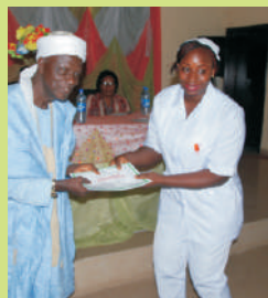
Tat Chalya Obstetrics & Gynaecology