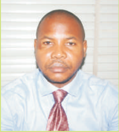
Eneh Chijioke Physiotherapy