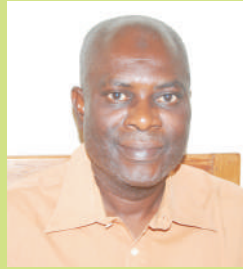
Mohammed Salaudeen Pharmacy