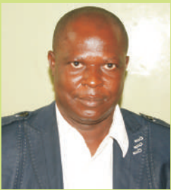
Captain Maliki Medical Laboratory