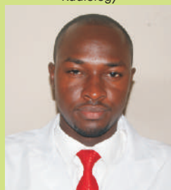
Nkeki Bullum Pharmacy