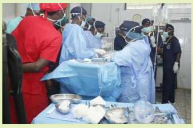
Blue Team managing Baby 'B' after the separation.