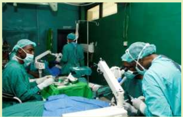
One of the sessions during the free surgery for patients with glaucoma in