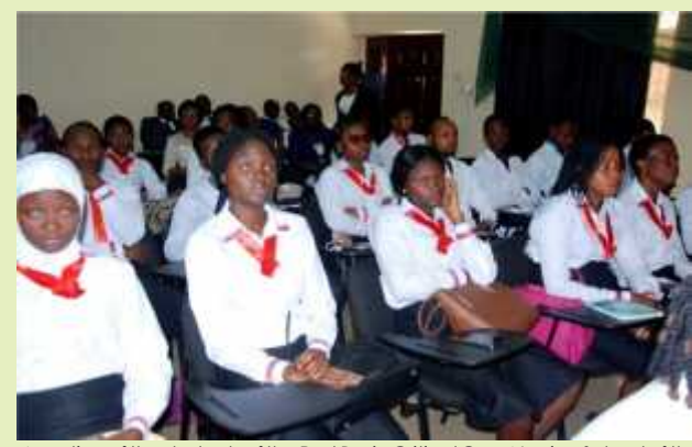
A section of the students of the Post Basic Critical Care Nursing School of the University of Abuja Teaching Hospital and Medical students of the University of Abuja at the Clinical Continuing Education session.