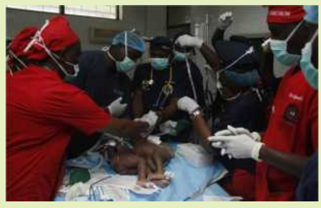
Preparing the babies for separation.