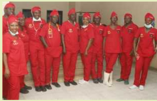
One of the teams that participated in the successful separation.