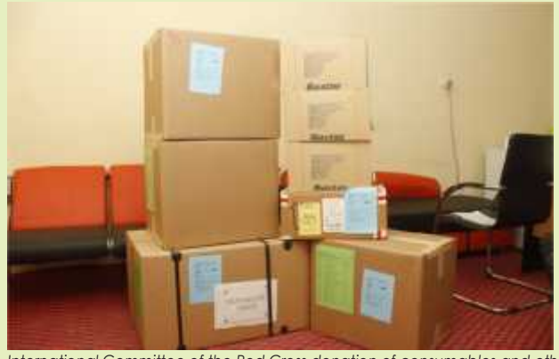
International Committee of the Red Cross donation of consumables and other dressing materials to the Department of Orthopaedics/Trauma.