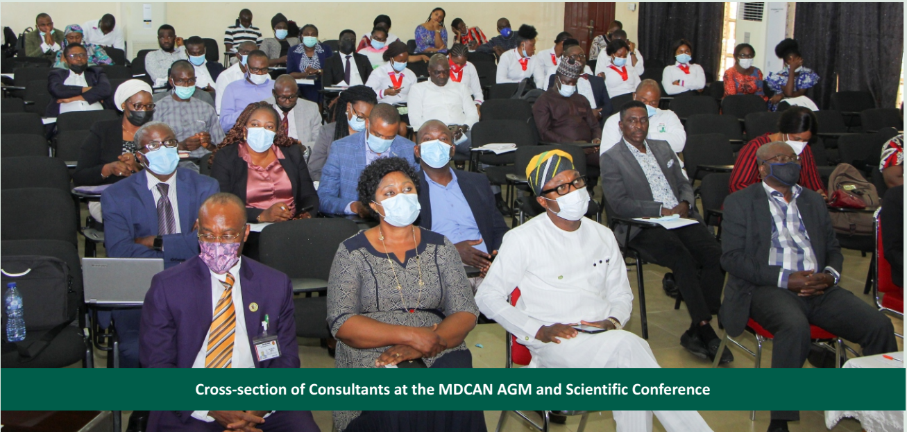
Cross-section of Consultants at the MDCAN AGM and Scientific Conference

The Medical and Dental Consultants Association of Nigeria (MDCAN) UATH chapter organized a scientific conference during her Annual General Meeting (AGM) that took place on 4th October, 2021 with the theme ‘Health challenges in the face of insecurity in Nigeria’: Rising beyond the tide.