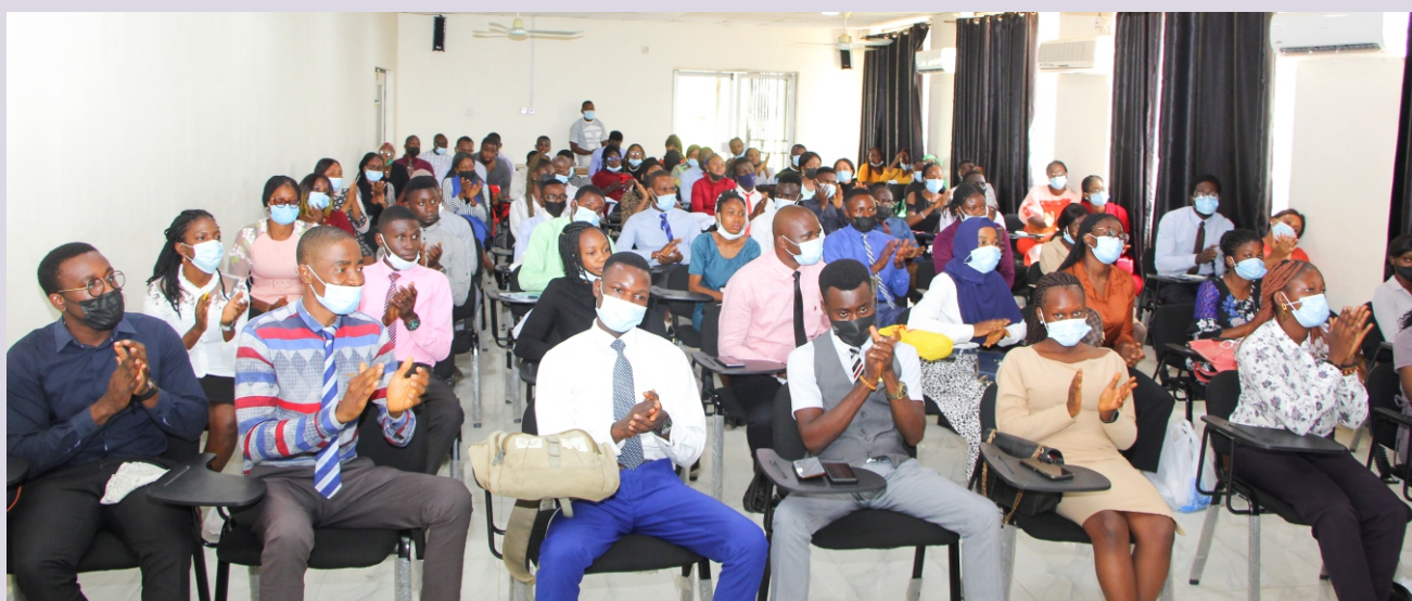
Cross section of 25th Set of the Post Basic Critical Care Nursing School, UATH at the orientation program.