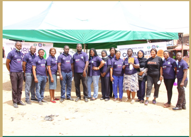
Staff of the Mental Health Department during the Community Awareness Campaign on Mental Health