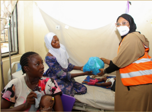
A member of the Sisters Connect Foundation presenting a gift to an indigent patient during their visit to the hospital