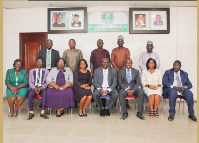
NUC Accreditation Team to College of Health Sciences Uniabuja Visit to UATH