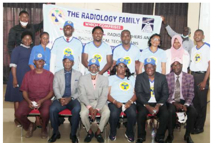
Members of the Department of Radiology in a group photograph on World Radiology day