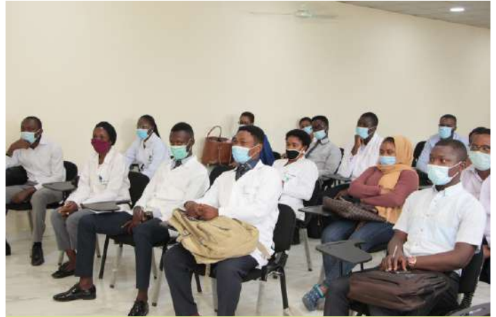
Recently employed House Officers in an orientation program in the Hospital