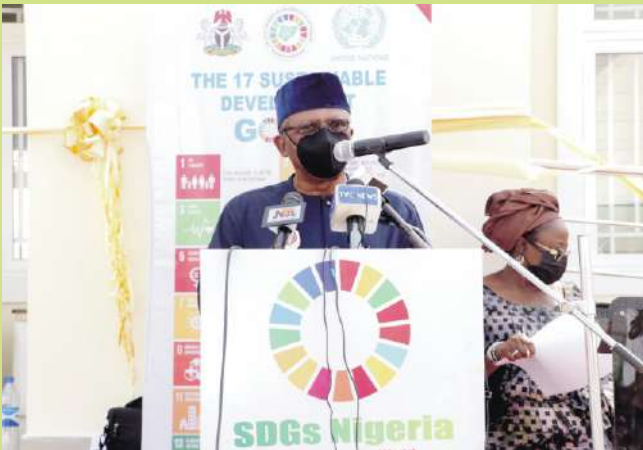
Minister of Health- Hon. Dr. Osagie Ehanire speaking during the commissioning of the Endocrine and Diabetes Centre