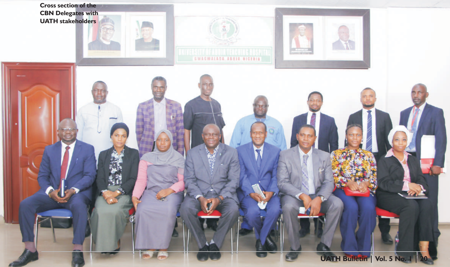
Cross section of the CBN Delegates with UATH stakeholders

After the round table discussion, a site inspection was conducted by the delegation after which the CMD thanked the team for the meeting and prayed for a positive outcome.