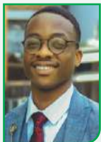
PRINCE ONUOHA LABORATORY (INTERN)