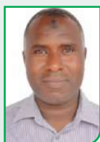
DR. ZAIYAD HABIB INFECTIOUS DISEASE CENTRE