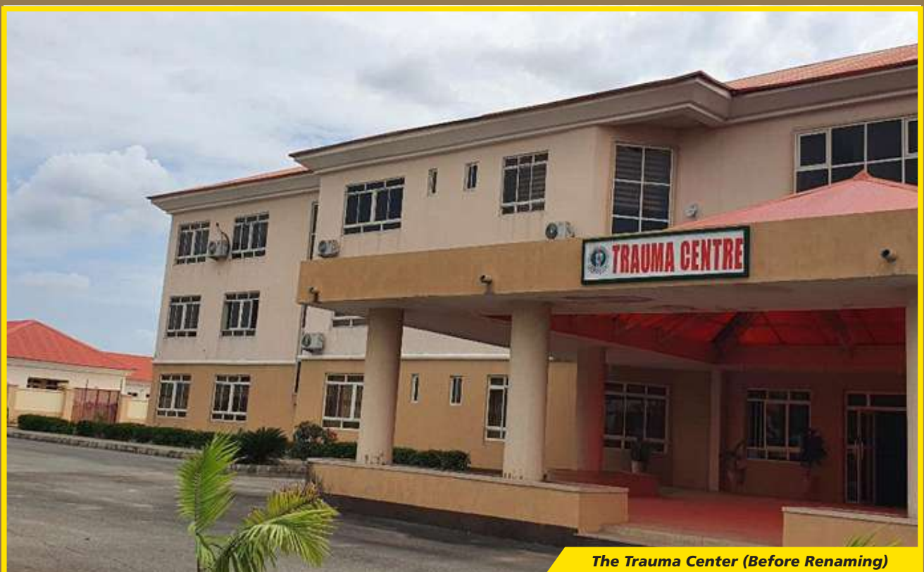
The Trauma Center (Before Renaming)

The Board Chairman promised her Excellency, Dr. (Mrs.) Aisha Buhari that “the edifice is going to be well managed. We also have a Management that is articulate and the University of Abuja which is standing as a rock behind us. We have Federal Ministry of Health giving us all the support, most especially the Hospital Services Directorate. We have students who are hungry to learn and subject themselves to tedious academic challenges and a Board that cares and monitors”. The Chairman said because the hospital has a culture of maintenance, the Centre will remain the same even in five years' time.