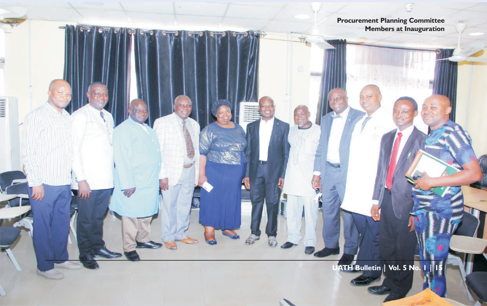
Procurement Planning Committee Members at Inauguration

procurement guidelines and the recent circular from the Office of the Secretary to the Government of the Federation, it is mandatory that at the beginning of every financial year, all procuring entities are expected to establish a Procurement Planning Committee for the year in line with the budget”. He stated that having received and collated the list of needs from different departments of the hospital; the Procurement Planning Committee has the duty of analyzing and planning before uploading to the Nigeria Open Contracting Portal (NOCOPO) platform. He said the essence of this exercise was to promote transparency as the appropriated capital projects are uploaded to this open portal for the general public.