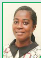
RAHILA BODAM THEATRE