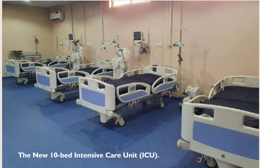
The New 10-bed Intensive Care Unit (ICU).