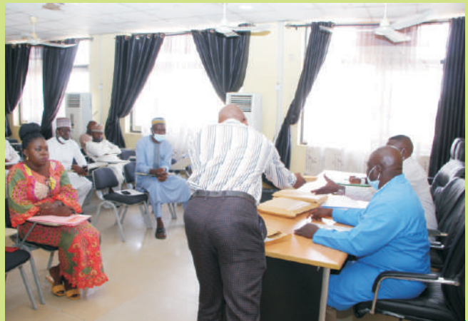
Observers and company reps during the Bid Opening of the Amenity Ward Project