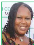
LOVETH ABALAKA COMMUNITY MEDICINE