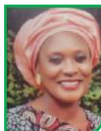
ESTHER DANIEL LABORATORY