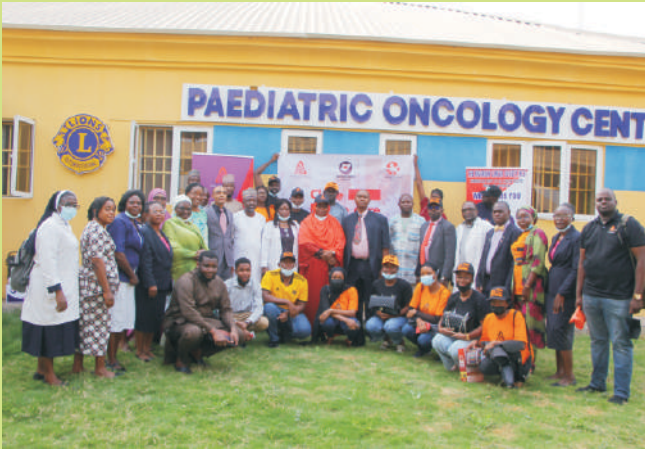
Cross section of AAA Memorial Foundation and UATH Staff