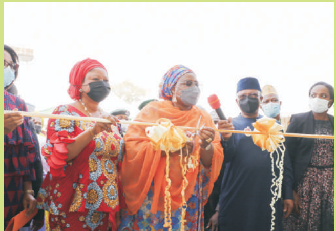
Dr. (Mrs.) Aisha Buhari commissioning the Professor Anumah Diabetes and Endocrine Centre.