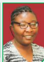
ANIBUEZE CHIDINMA LABORATORY