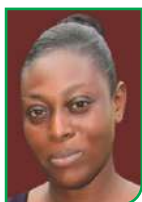
OLORUNTOABA SJI ICT