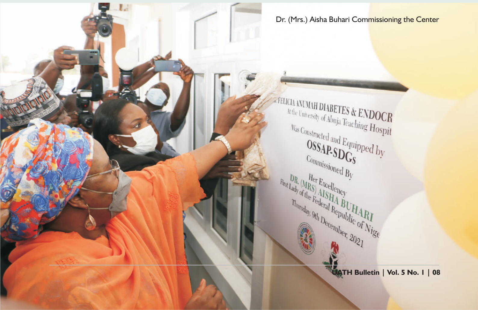
Dr. (Mrs.) Aisha Buhari Commissioning the Center