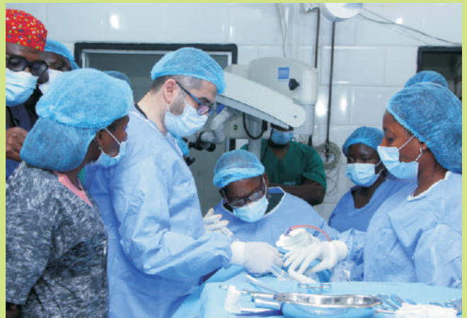
The ENT Surgery Team During the Cochlear Implant Surgery