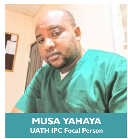
article of ours.

e are living in challenging times in terms of emerging diseases of public concern which have overstretched our available health care resources. We have recently witnessed the emergence of Covid-19 which united the world in one of the largest coordinated efforts of pandemic containment in the history of infection prevention and control and through concerted multi- stakeholder efforts of WHO, NCDC, FMOH, and other agencies. The threats have been brought down to a manageable level, though the need to strengthen our IPC infrastructures and knowledge-base still remains. Locally, thanks largely to good pro-active measures implemented by UATH ably led by our highly competent Chief Medical Director- Prof. Bissallah Ahmed Ekele, the IPC risks in our care areas have largely been mitigated. As the saying goes, ``Infection prevention and control (IPC) structures are as strong as its weakest link ``, Meaning there is need to approach IPC in a holistic manner in such a way that none of the components are overlooked [staff knowledge, IPC infrastructures, role /responsibility allocation etc]. The ultimate goal of facility IPC is to protect our patients, protect our health care workers (HCWs) and to protect visitors to the hospital and through that, protect our communities. To help meet these IPC goals, health care waste management (HCWM) will be our topic of discussion in this maiden