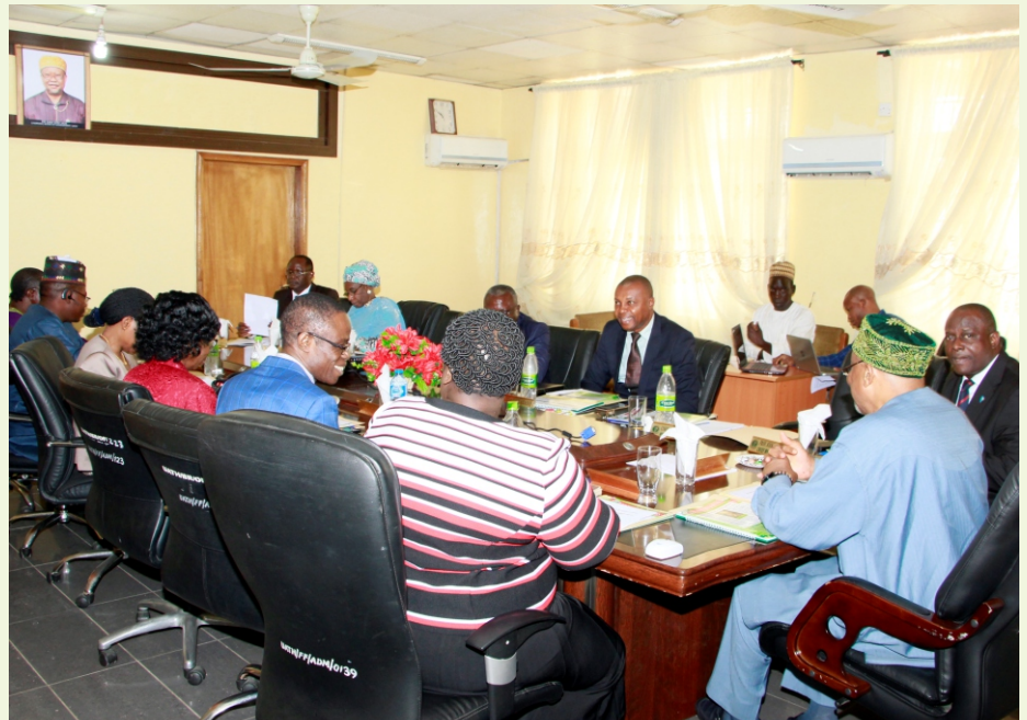
Board of the University of Abuja Teaching Hospital in session.

Below is the list of the promoted staff and their new ranks: