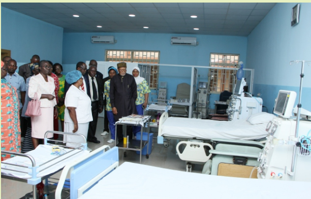
Members of the Board inspecting facilities in the dialysis unit.