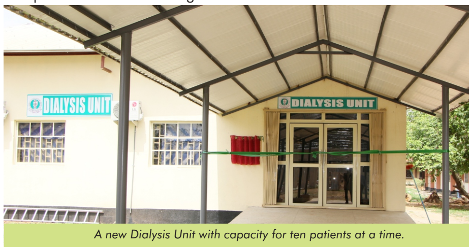
A new Dialysis Unit with capacity for ten patients at a time.