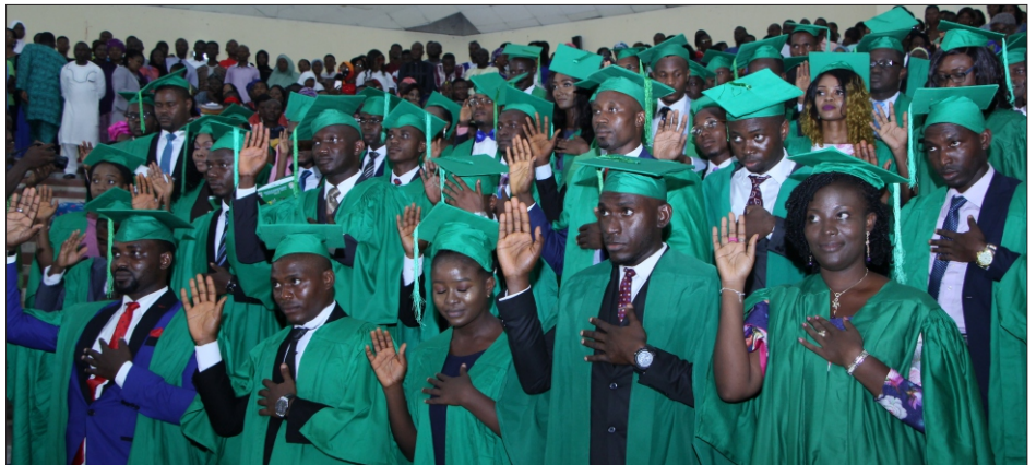
Third set of Medical Doctors of the University of Abuja at their induction on 8th June, 2019.