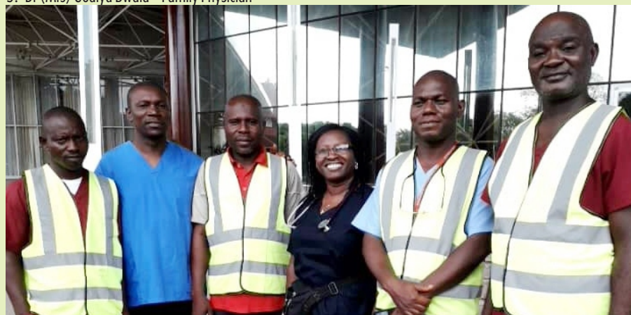
A section of the Presidential inauguration and democracy day Medical Team.