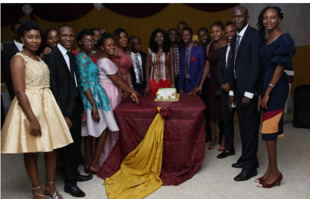
2019 out-going interns of Laboratory services celebrating the end of a successful internship.