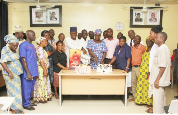
Members of staff on the list of Leadway Pension Managers celebrating the 2019 Valentine's Day.